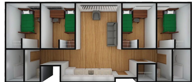
4 Bedroom 2 Bathroom Apartment (Kitchenette)

Disclaimer: These are artistic renderings and do not depict the final room designs.