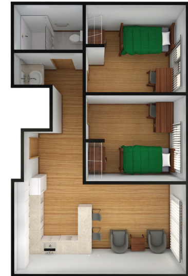
2 Bedroom 1 Bathroom Apartment (Kitchenette)